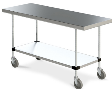
Stainless Steel Worktables