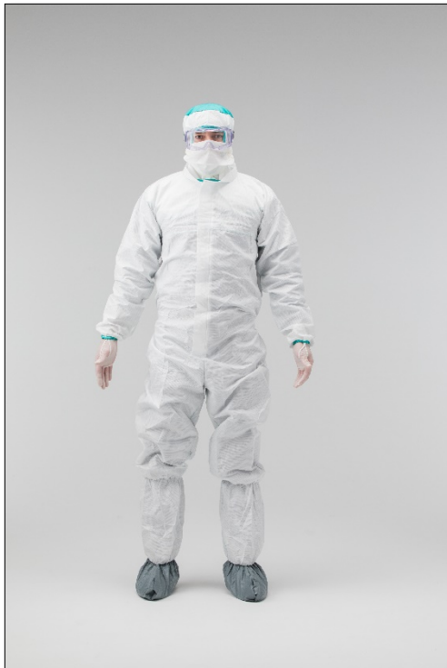
SMS Easy2Gown Coverall with Attached Boots and SMS Open Face Hood

* Data shown here are typical values and should not be used as specifications