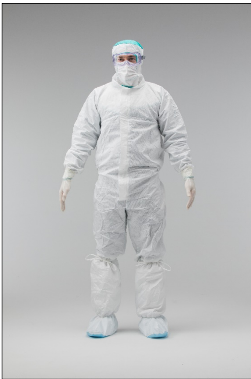
MP Easy2Gown Coverall, Hood with Integrated Face Mask & Knee-High Boots

* Data shown here are typical values and should not be used as specifications