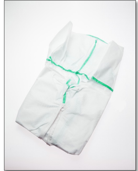
Folded Easy2Gown Coverall

This patented fold has been designed to minimize contact between the operator and the outside of the gown. By presenting the interior of the gown upon opening the package, the sterile exterior is protected from the transfer of contamination during the gowning process. Trained personnel will be able to gown without contact to the sterile, exterior, portion of the gown. The easily distinguished surface creates significant reduction in operator prep time while reducing manipulation of the garment itself.