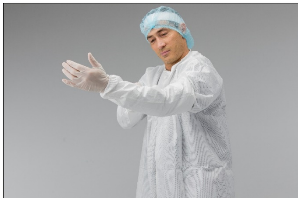
MP Protective Sleeve

VAI's sterile disposable frocks are offered in SMS and MP fabric and come standard with a zipper closure for increased contamination protection, elastic thumb loops to reduce shifting, and a comfortable wrist cuff. Frocks are folded in a manner that allows them to be quickly and cleanly donned.