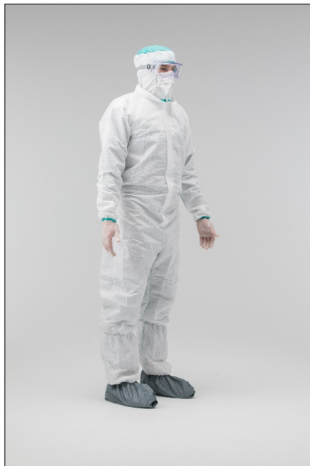
SMS Coverall with Attached Boots