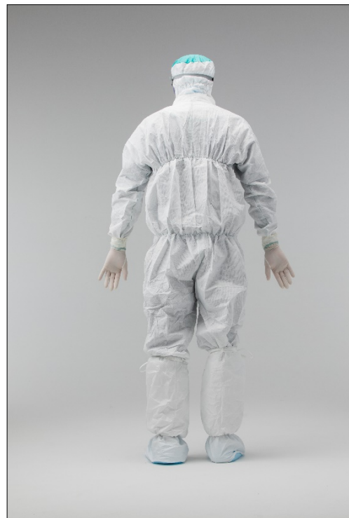
MP Easy2Gown Coverall, Hood with Integrated Face Mask & Knee-High Boots