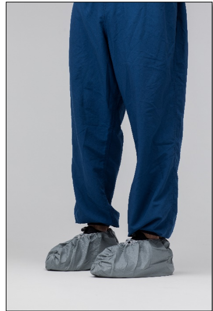
Gray Boot Covers

Cleanroom Boot Covers are latex and lint free, with a seamless bottom, suitable for use in a clean environment. The boot covers are manufactured from a blend of polyolefin coated polypropylene then uniquely constructed to create an impervious sole and side with an elastic ankle. This combination offers extraordinary traction and skid resistance. Furthermore, the covers are extremely durable, and resistant to liquids. Overall, this is the toughest, most durable and impervious boot cover currently on the market. The boot covers are ideal for wash down uses, cleanroom uses, and are built specifically for use in low traction areas.