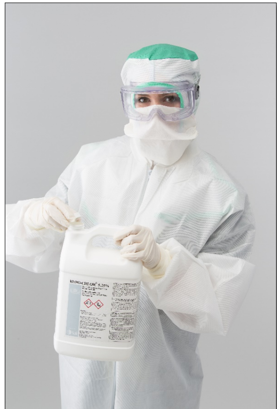
MP Easy2Gown Coverall and MP Open Face Hood with a MP Frock