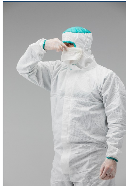
PF-2 Face Mask with two Elastic Ties