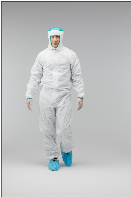
MP Classic Coverall