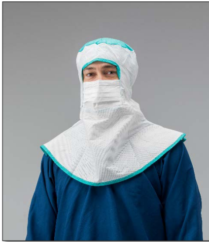
SMS Hood with Integrated Face Mask