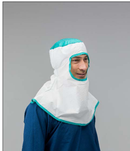
MP Open Face Hood