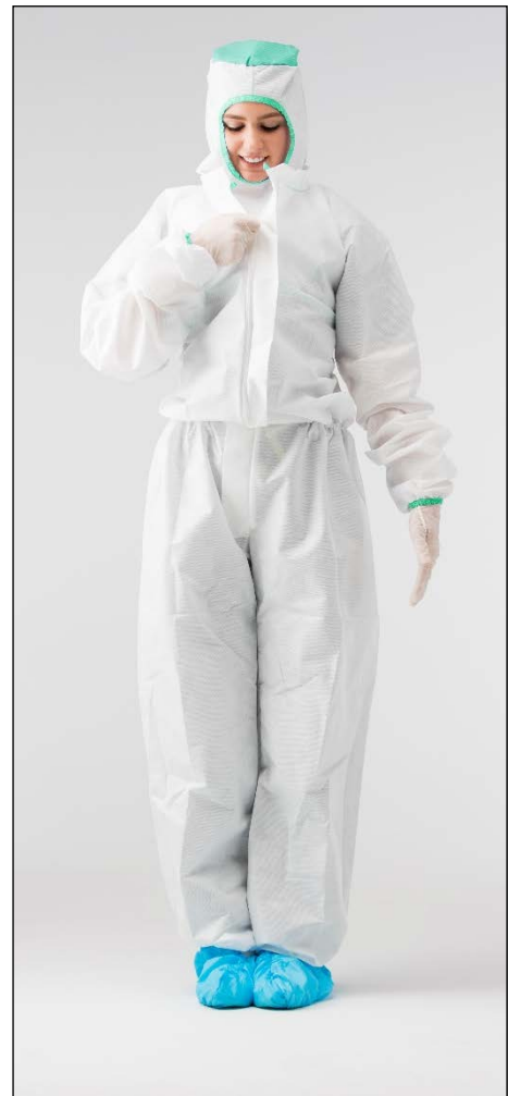
SMS Easy2Gown Classic Coverall with SMS Open Face Hood