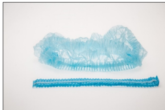
Bouffant Hat Folded