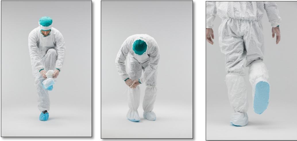
MP Knee-High Boot