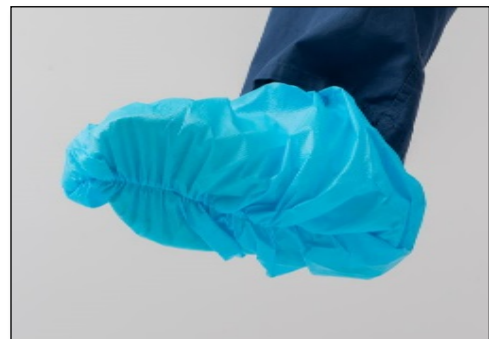
Blue Shoe Covers Non-Skid Bottom