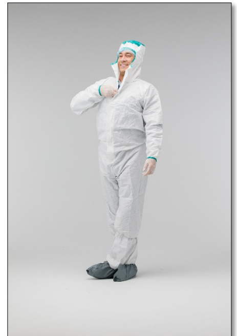
SMS Coverall with Attached Hood & Boots