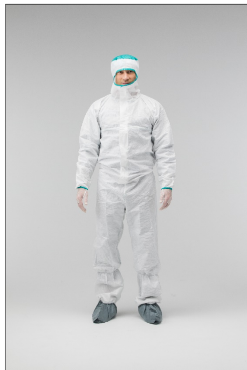
SMS Easy2Gown Coverall with Attached Hood and Boots