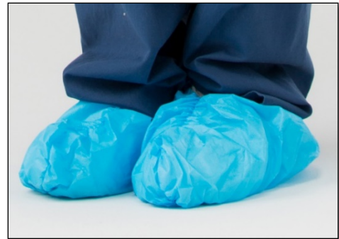
Blue Shoe Covers

VAI’s Shoe Covers are latex and lint free, with a surged bottom seam that is made to be suitable for the use in clean environments. These shoe covers are a special polyolefin blend laminated to a polypropylene substrate. Due to this special blend, these shoe covers offer the best traction properties and skid resistance currently available in any shoe cover. These shoe covers are built specifically for use in low traction areas. Furthermore, the covers are extremely durable, resistant to liquids, and have an elasticized top opening.