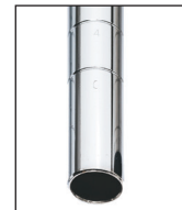
Post for Stem Caster