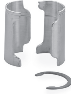
Aluminum Split Sleeve