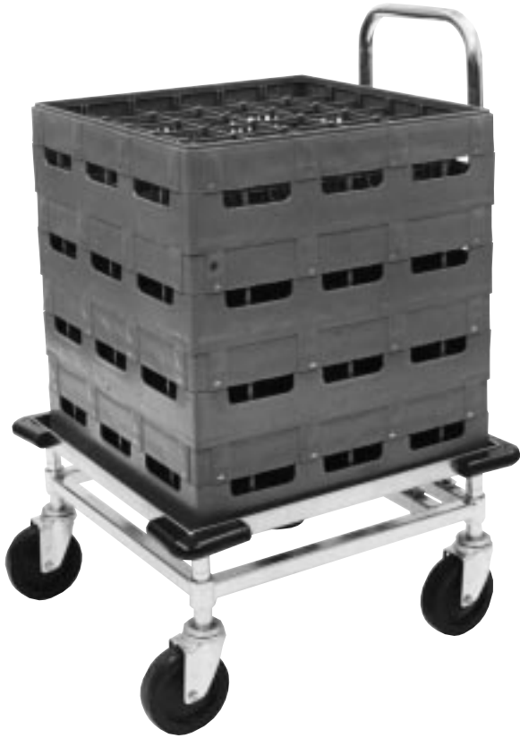
Model CBH2121C (with Sani-Stack Racks)