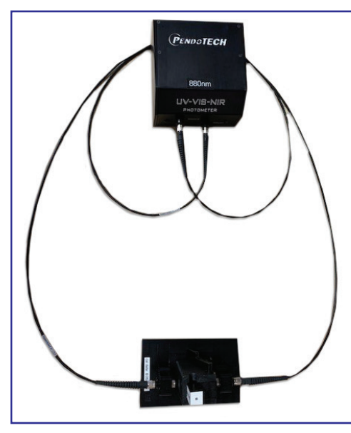
Test Rig Connection to Photometer