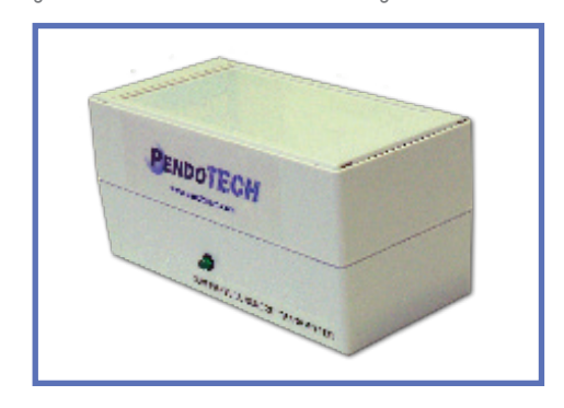
PendoTECH Temperature Transmitter