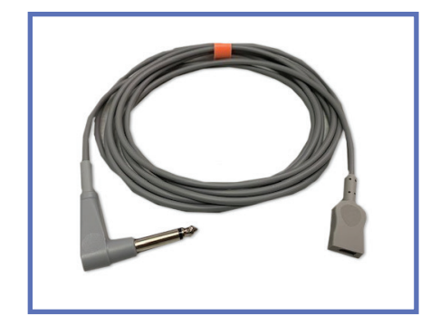
Monitor Cable for Hose-barb Sensor and Dip Probe