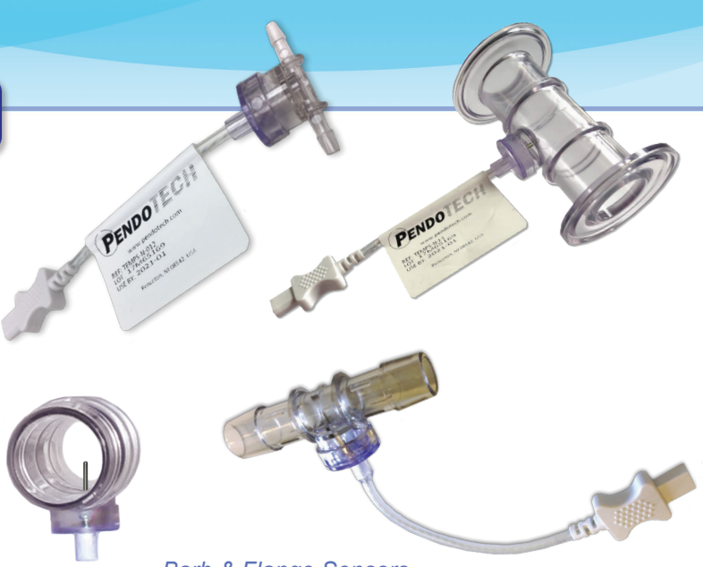
Barb & Flange Sensors