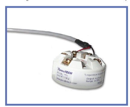
PendoTECH Temperature Sensor Transmitter