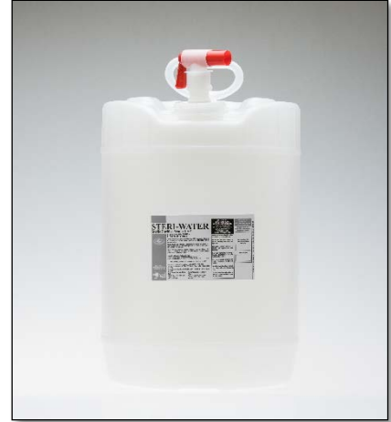
STWA-5G with Faucet