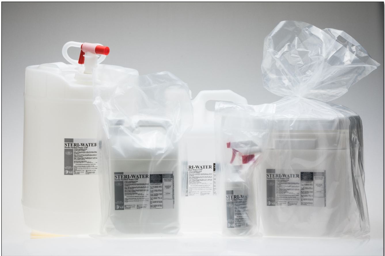
STERI-WATER Family of Products

(Any specific product label is available upon request.)