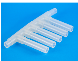
One-piece overmolded C-Flex® manifold maintains inner bore diameters with superior reliability and product integrity.