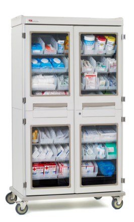
DOUBLE WIDE SXRD76MXD2