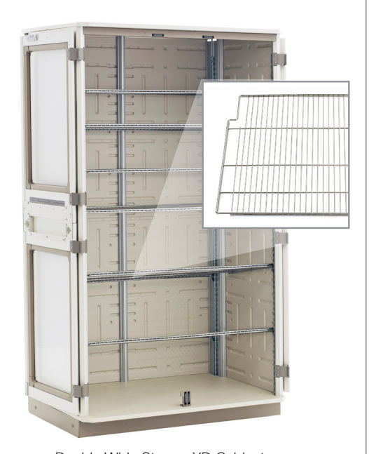
Double Wide Starsys XD Cabinet Adjustable Wire Shelving shown at -20° angle