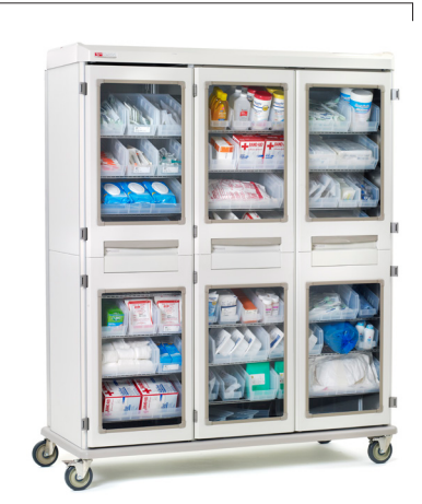
TRIPLE WIDE SXRT76MXD1