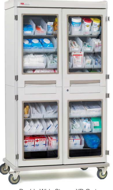
Double Wide Starsys XD Cart SXRD76MXD2