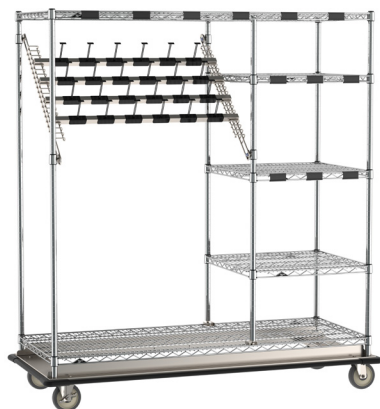
CPC3/2LC Standard combination style with 36" (910mm) bars and 24" (610mm) shelves. (Shown with optional label holders)