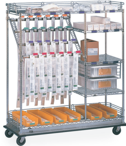
Deluxe Combination Style with 36" (910mm) bars and 24" (610mm) shelves.

CPCD3/2LC (Shown with optional label holders)