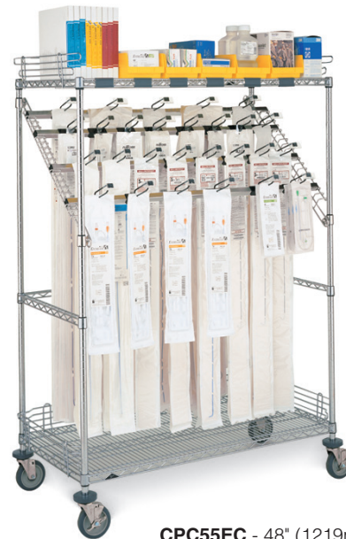
CPC55EC - 48" (1219mm) Bars

CPCD3/2LC (Shown with optional label holders)