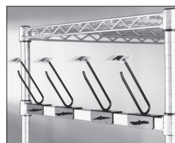
Close-up of Catheter Side Bar