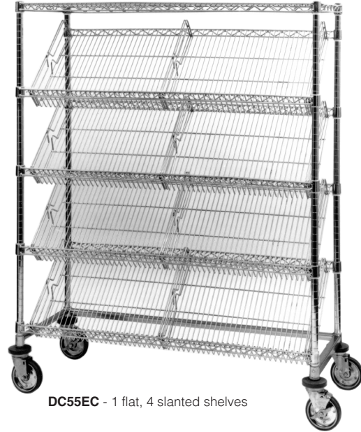
DC55EC - 1 flat, 4 slanted shelves