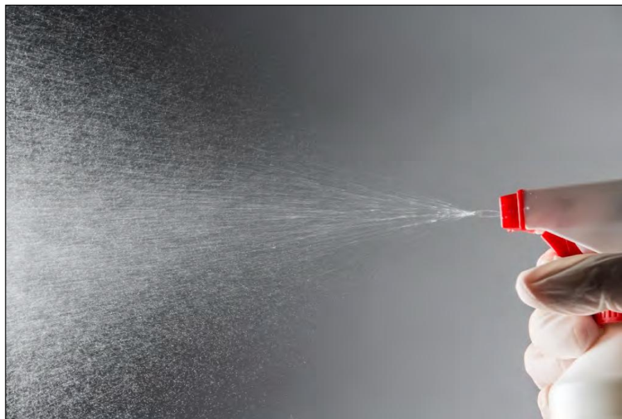
Spraying a HYPO-CHLOR 5.25% , 0.52% , or 0.25% Trigger

Rinsing may be done with sterile water, if needed.