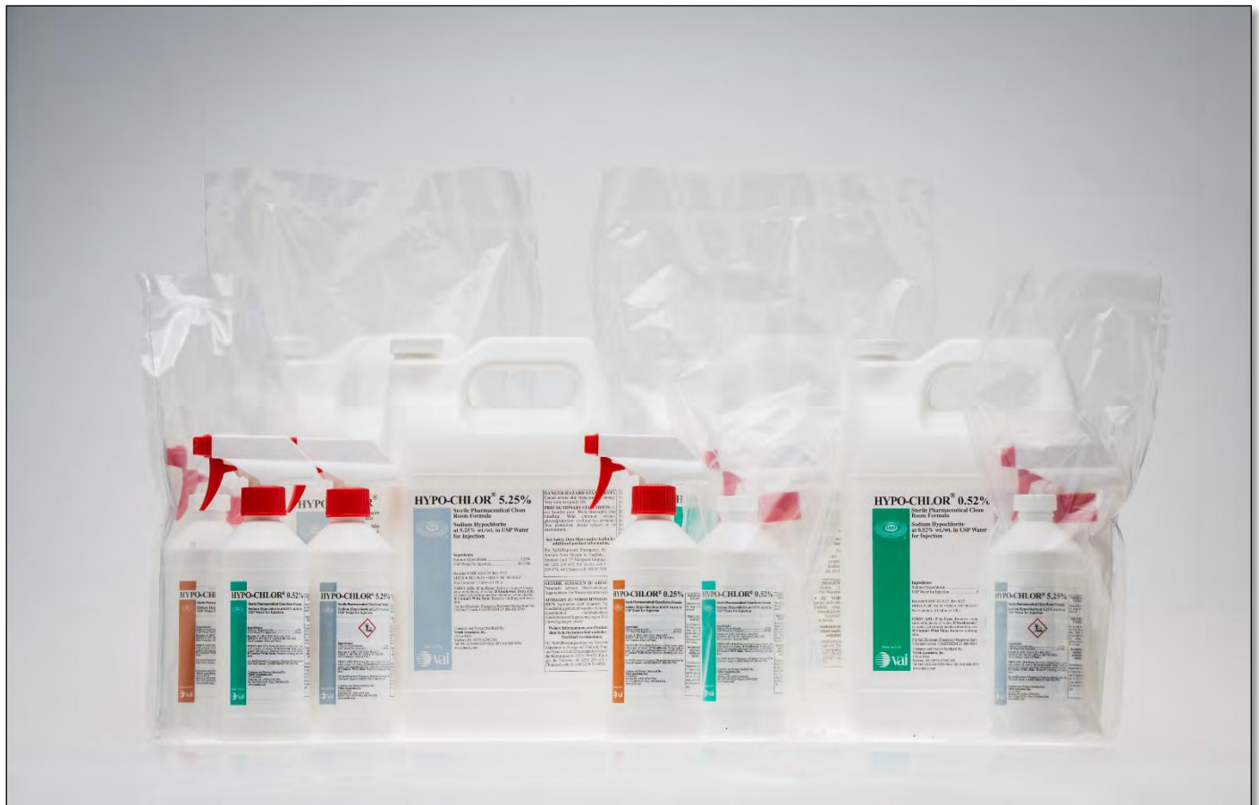
HYPO-CHLOR 0.25%, 0.52%, and 5.25% Family of Products

(Any specific product label is available upon request.)