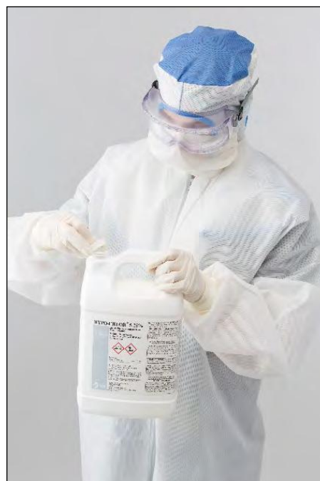
Opening a sterile 1 gallon HYPO-CHLOR 5.25% , SHC-02-5.25