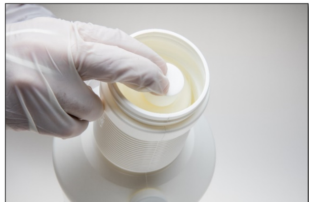
1 gallon SimpleMix Bottle