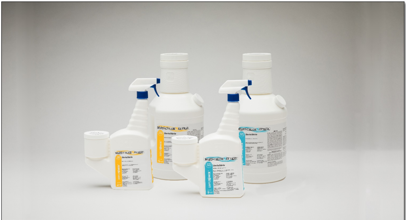
HYPO-CHLOR Neutral Family of Products

(Any specific product label is available upon request.)