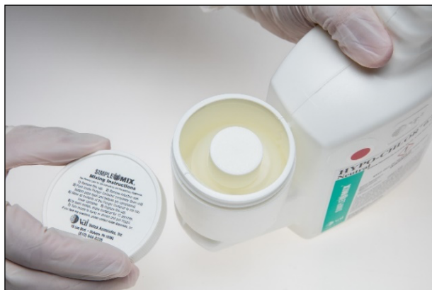
16 oz SimpleMix Bottle

Veltek Associates, Inc. has developed the patented SimpleMix System Technology to eliminate measuring and additional containers. It provides for the transfer of the sterile concentrated disinfectant, sporicide, or activating agent, and sterile water in a sealed container to the aseptic area. The system container is double bag packaged for easy transfer and eliminates all internal and external sterility concerns. The patented SimpleMix System Gallon, 16oz, and 200 L systems provide a sealed multi-chamber container that when activated mixes the solution to the correct use dilution. The opening on the top of the gallon size contains the concentrate and the bottom reservoir contains the VAI WFI Quality Water or Sodium Hypochlorite Solution. The 16 ounce side container houses the concentrate and the bottom reservoir houses the VAI WFI Quality Water or Sodium Hypochlorite Solution. Just open the small chamber cap, push the plunger container completely down until the bottom pops open and the bellows are compressed. 200 L SimpleMix systems are activated through a hose and valve system connecting the cubicontainer of concentrate to the VAI WFI Quality Water or Sodium Hypochlorite solution. The system design permits the easy transfer of the product to the aseptic manufacturing area without concern for the transfer of contamination.