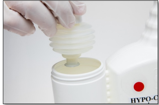
SimpleMix Bottle with Activator

HYPO-CHLOR Neutral 0.25% and 0.52% are activated via the SimpleMix System by neutralizing the pH. The activator is housed in the small chamber suspended above the sodium hypochlorite solution in the large chamber below. Once the SimpleMix plunger is pushed, the activator is mixed into the solution following the SimpleMix directions. Testing has shown that HYPO-CHLOR Neutral Products are effective as neutralized cleaners for up to 24 hours post activation.