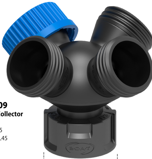
A 306 509 4-in-1 Collector NICOLE • 4x GL45 • L1 = GL45