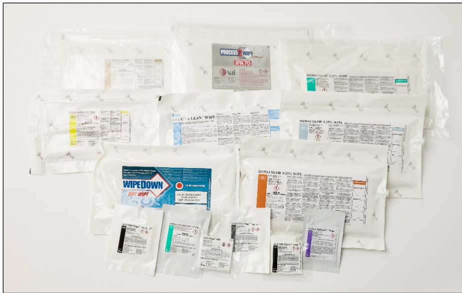
VAI®'s Wiper Family

Veltek Associates, Inc. Disposable Products Manufacturing Division's capabilities include sterile disposable garments, sterile disposable face masks, dry wipers, sterile wipers, custom cleanroom documentation, sterile synthetic writing substrate, and a HEPA filtered cleanroom printer. DPMD has responded and met demands of professionals in the industry since 1985. Our manufacturing capabilities assure that we will be able to meet all requests and fulfill all of our customer's needs. All DPMD products are processed and packaged in cleanroom facilities from beginning to end and subsequently gamma irradiated or aseptically filled in order assure sterility. For more information call 610-644-8335, email sales@sterile.com or visit our website at www.sterile.com .