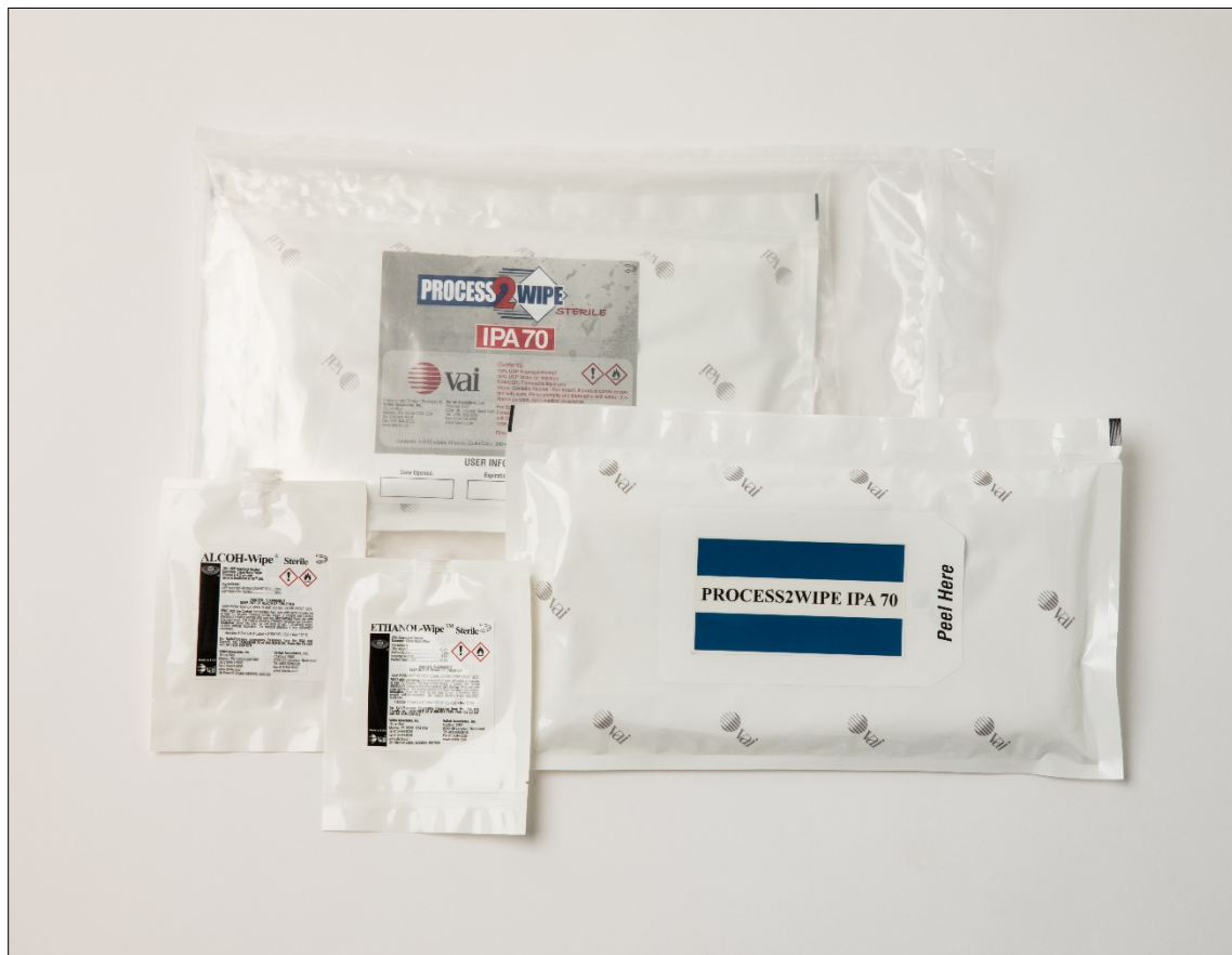
Alcohol Wipes Family

(Any specific product label is available upon request.)