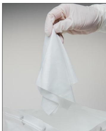
100% Polyester Wiper Substrate