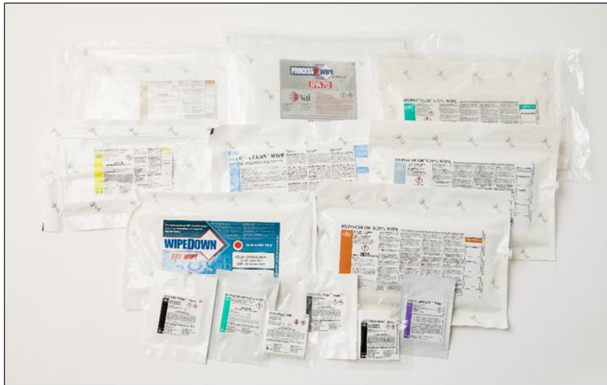
VAI®'s Wiper Family

Veltek Associates, Inc. Disposable Products Manufacturing Division's capabilities include sterile disposable garments, sterile disposable face masks, dry wipers, sterile wipers, custom cleanroom documentation, sterile synthetic writing substrate, and a HEPA filtered cleanroom printer. DPMD has responded and met demands of professionals in the industry since 1985. Our manufacturing capabilities assure that we will be able to meet all requests and fulfill all of our customer's needs. All DPMD products are processed and packaged in cleanroom facilities from beginning to end and subsequently gamma irradiated or aseptically filled in order assure sterility.