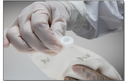
Ported Bag for Aseptic Filling