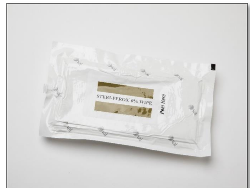
Peel & Reseal Label