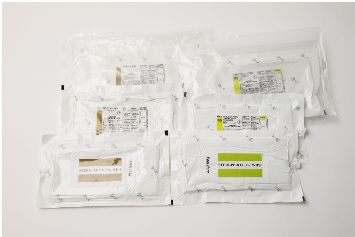
STERI-PEROX Wipe Family

(Any specific product label is available upon request.)