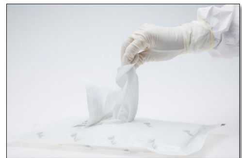
Peel & Reseal in Use