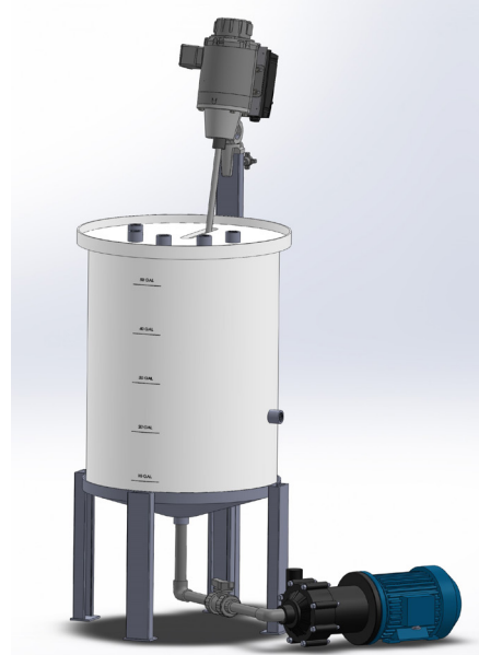
Shown = 50gal HDPE tank, with C clamp mixer, ball valve, and pump, fittings to suit